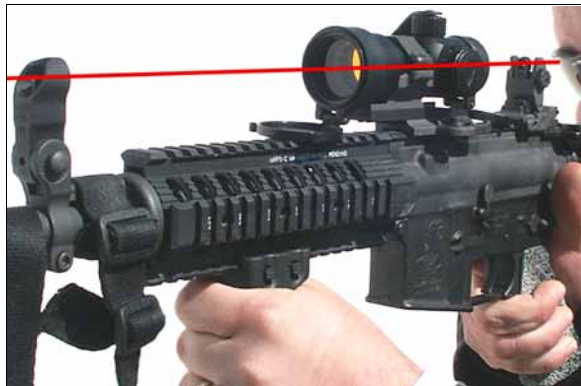
Cantilever Perfect Co-Witness Spacer Perfectly Aligns The Iron Sights & “The Dot”

Your PCW spacer is pre-dimensioned for AR15/M16 weapons. If you face unique adjustments, ask your dealer to ship your firearm to Mounting Solutions Plus for adjustment of your PCW mount. Otherwise, never attempt to re-adjust your mount.