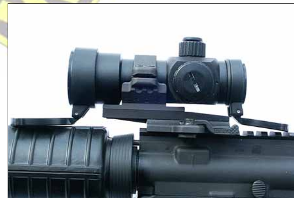
SPOT scope shown on ARMS 22 M68 Ring mounted to ARMS 17 base with PCW Cantilever Spacer.

Note: MSP recommend scope caps always be turned to open down to minimize visual blocking.